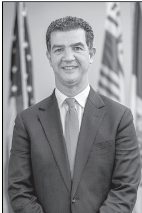
NYC DOT Commissioner Ydanis Rodriguez

In May of 1983, with the support of Remove Intoxicated Drivers; balloons were released from the steps of the Capital. They simultaneously were released in Buffalo, in Syracuse, and in New York City in a call to legislators to pass legislation to ensure Victims Rights and to pass measures to reduce the catastrophic loss of life and injuries resulting from impaired drivers.